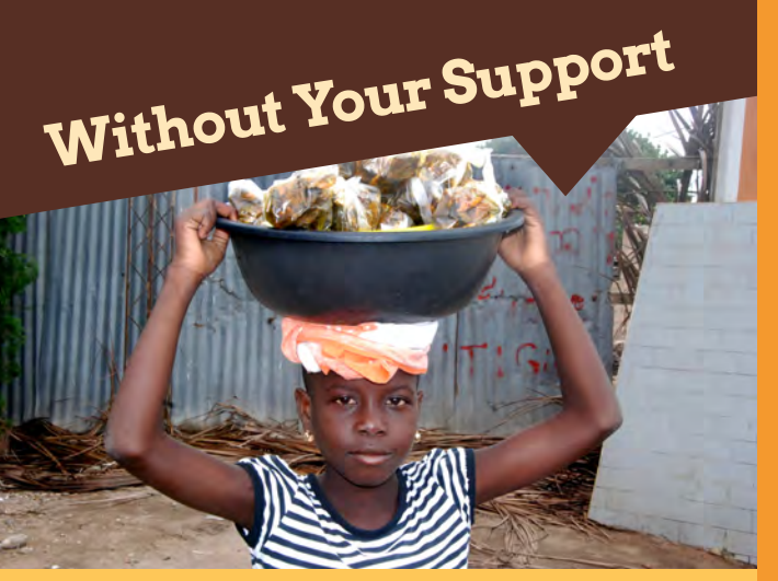
Without the money for school fees, children work in the markets.

The fulfillment of this mission will equip the children with the ability to succeed, and in turn, serve as catalysts for change and development in their communities.