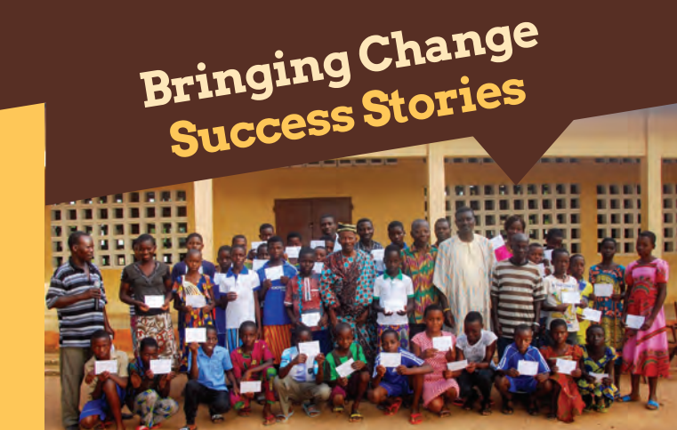
Children hanny to see us have the way to their schooling by naving their school fees

Moreover, some children are sold into slavery by their parents, while others resort to, or are encouraged to prostitute themselves.